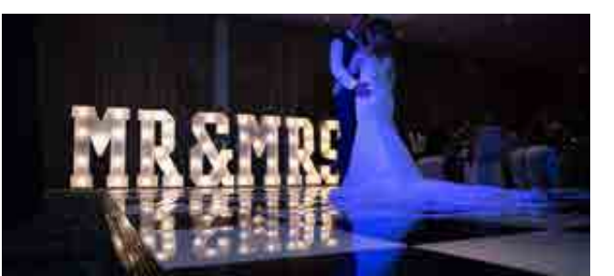
We'd like to say a big congratulations to all the couples in our brochure and a massive thank you for letting us share your big day through your amazing photos.